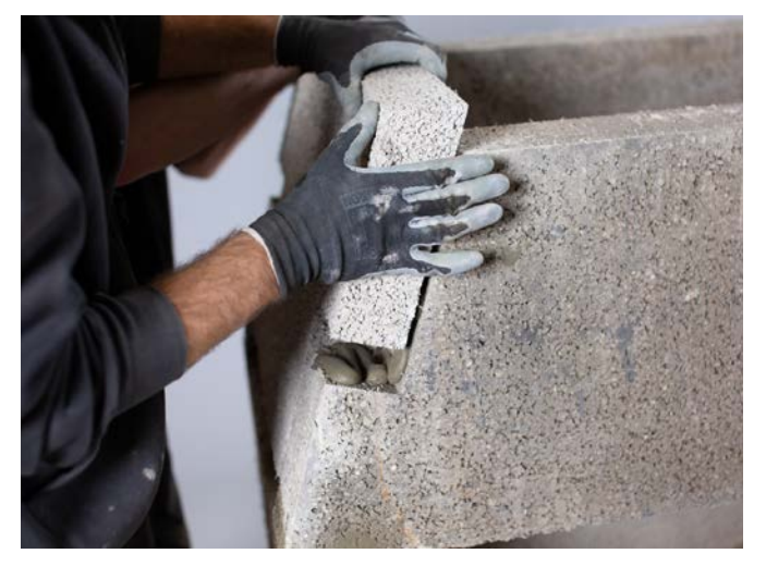
Press the side panels of the gather into place.