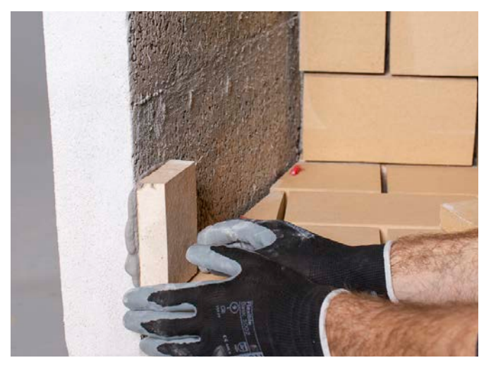
Once the bottom and rear firebricks are in place, fasten the side bricks in position using the firebrick mortar. Use a tile spacer to keep an 8mm gap. During the first and second level, you must slot in the grill supports as shown in the next step \rightarrow