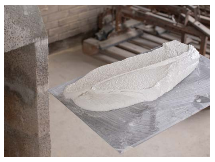
Mix the render as per the instructions