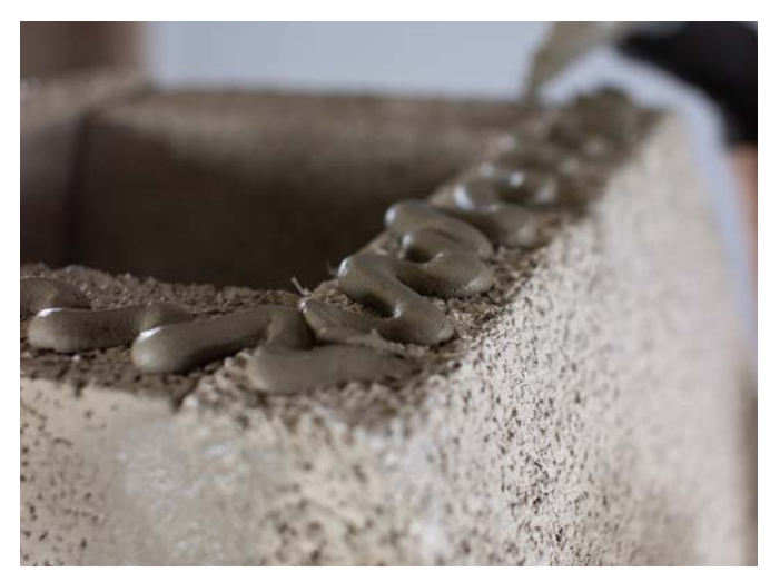
Apply a layer of lip glue around the top of the first block and then press the second block into place. Ensure the top is level and clean off any excess glue.