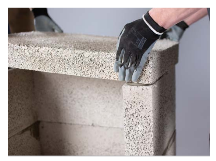
Carefully lower the top slab into position and ensure the surface is level.