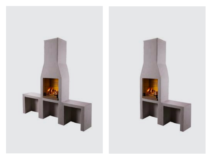
The additional log stores can be placed to either side or on both sides of the fireplace to suit your outdoor area plans.