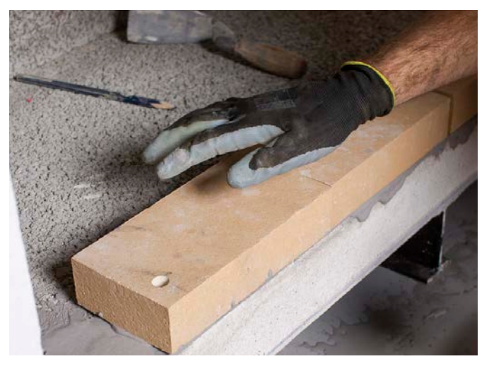
Bed the firebricks on to a 3mm layer of firebrick mortar. Use the tables on the previous page as a guide.