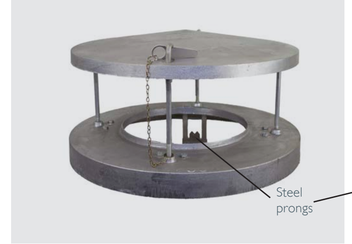
Rain cap and top ring if purchased.

Bend the steel prongs out so the top ring is a tight push fit into the concrete capping.