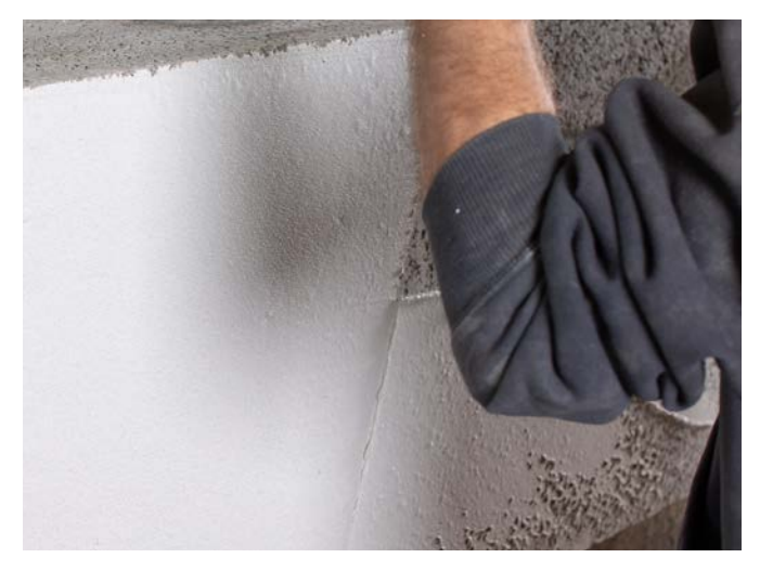
Render the surface areas.