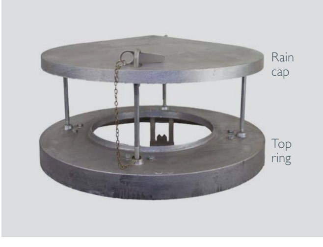
130732 Rain cap for all models 135070 Top ring for 500 model