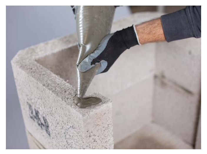
Apply a layer of lip glue adhesive around the top edge of the C section.