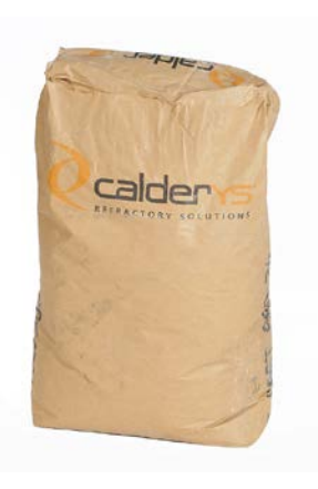
Mortar bag - Used for gluing on firebricks and pointing in. Mix as per instructions on the bag