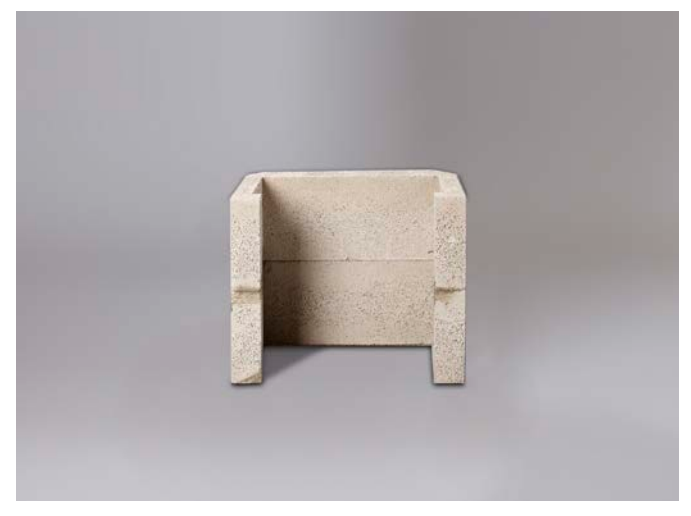
Create a suitable base. We recommend 100mm thick reinforced concrete. Bed the two C sections using the supplied lip glue adhesive. Check each stage is level.