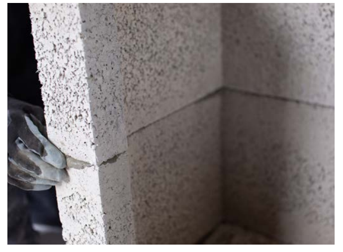
Place the next C shaped section on top of the first one.