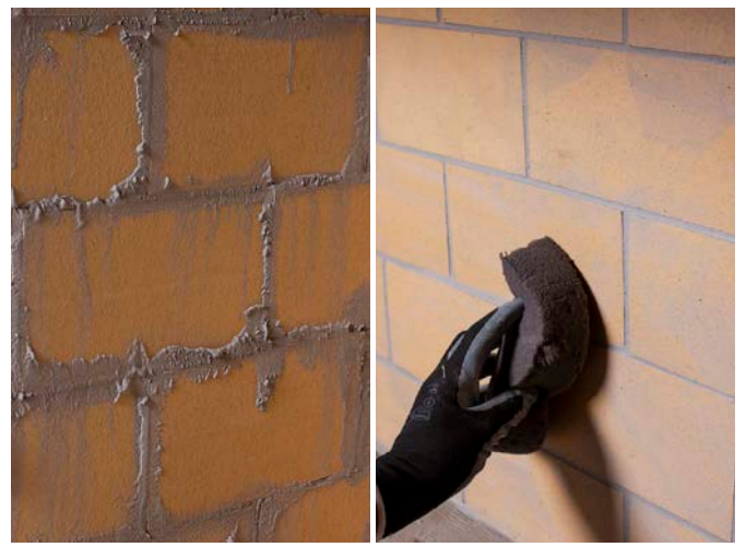
Use the mortar mix to point up the joints between the firebricks once they are all in position. Clean off excess mortar.