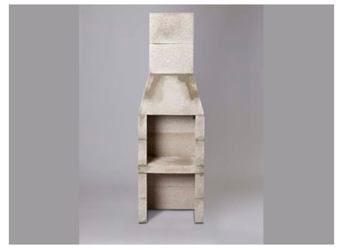
Apply a layer of glue on the 2 \times chimney blocks. Check all is level and wipe off excess glue.