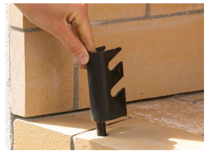
Drill 2 \times 12 mm diameter holes in the front row of the firebricks. Push log retainer holders in place.