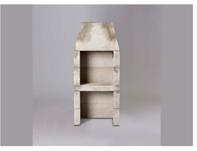
The fireplace with the gather unit should resemble the image above.