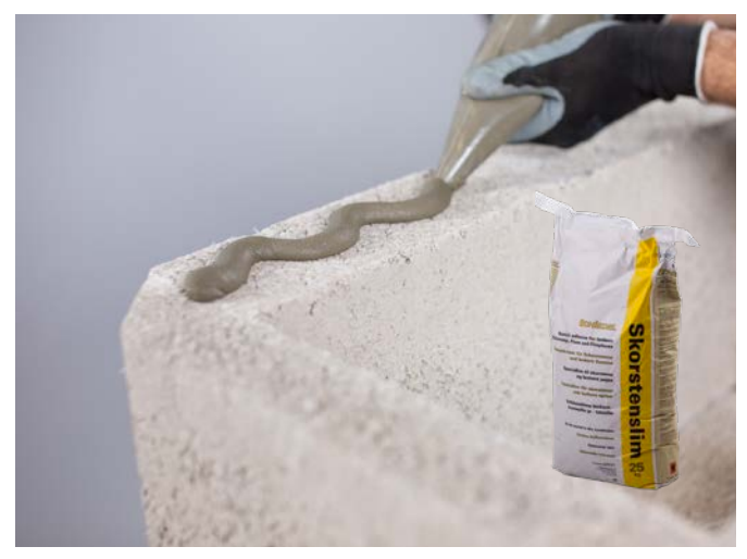
Mix lip glue jointing adhesive as per instructions on the bag. Apply 15-20mm beads using the supplied application bag as shown in the picture above.