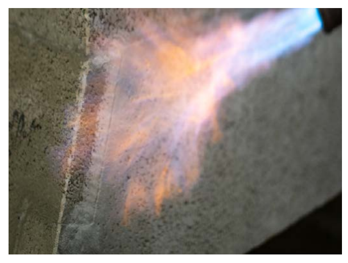
Burn off the fibres on external surface before rendering.

Render plaster is designed for one coat, if you require more coats you will need to purchase more render.