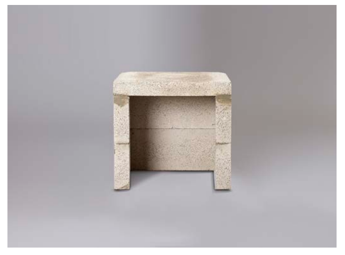
Apply lip glue around the top of the C section and then press the base plate down into position. Check that it is level.