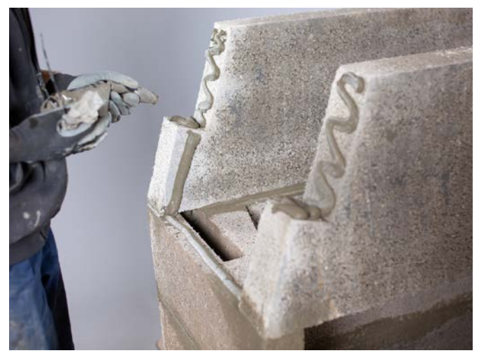
Apply lip glue to the joints on the sides of the front and rear panels of the gather.