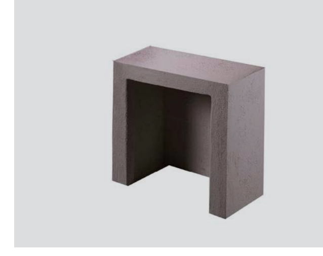
157838 Side log store