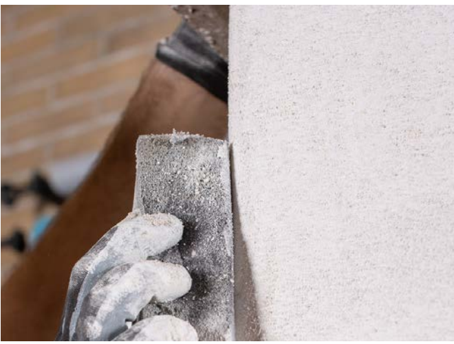
Ensure the edges are smooth and wait to dry.