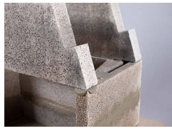
Apply lip glue to the top layer and then press the front and rear sections of the gather into place.