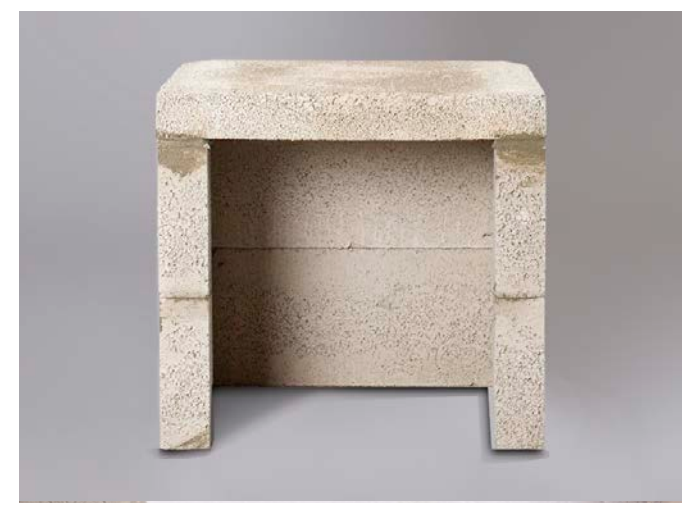
The completed log store can now be rendered as part of the overall rendering procedure. Follow the procedures shown on p.5 with regards to preparation and then rendering of the log store.