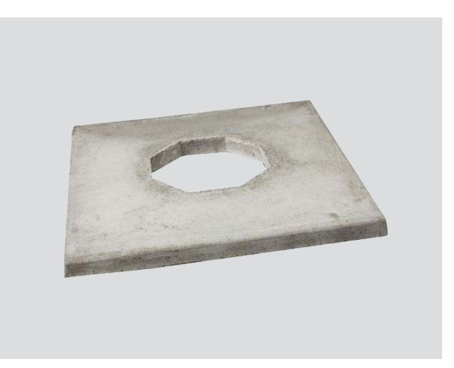
130710 Capping for 500 model