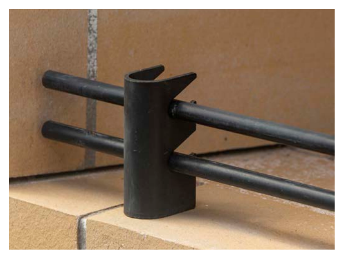
Then push fit the log retainer bars into the slots.