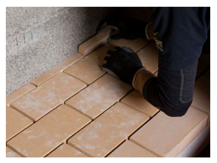
Complete the bottom layer of firebricks, then fasten the rear firebricks in place using the firebrick mortar. Use a tile spacer to keep an 8mm gap.