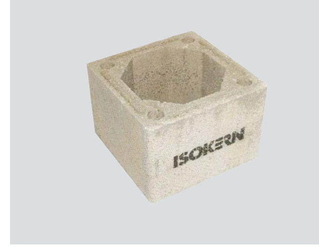
130727 Additional height blocks for 500