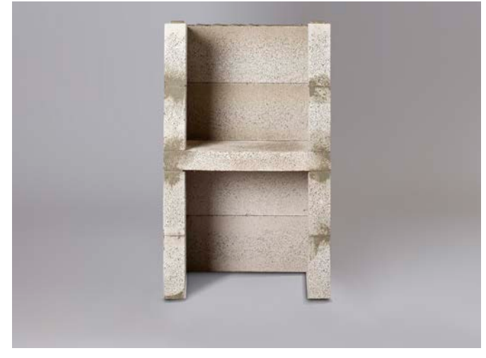
Glue on the next two C sections