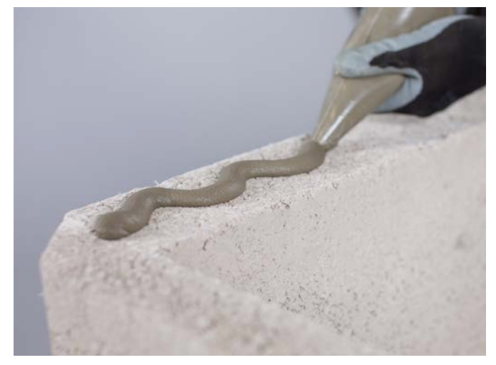
Place the C shaped section onto the prepared surface alongside the main fireplace and apply lip glue adhesive around the top edge of the section.