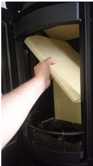
Now lower the throat plate baffle to remove

Attention, when removing the second side fire brick, ensure you support the throat baffle to prevent it from being dropped