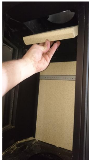
Lift the second throat baffle away from the retaining lugs and lower out